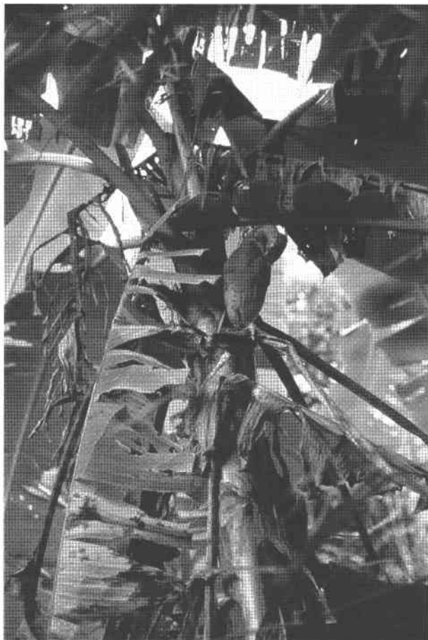
Figure 1. Madagascar Red Owl at a roost site.