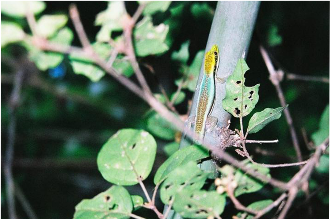
Figure 2. Phelsuma klemmeri found in the bamboo forest at Antsakoamalinka, western Madagascar.

These two day geckos were identified as Phelsuma klemmeri by their small size with a colorful yellow to orange head and neck, anterior back bluish and posterior brown with one light turquoise dorsolateral band, below one dark lateral band, and several white dorsal spots on hind legs. The tail was turquoise in both individuals (see Fig. 2). No tissue samples or specimens were collected. These two P. klemmeri were sympatric with P. kochi and P. mutabilis , but did not occupy the same microhabitat.