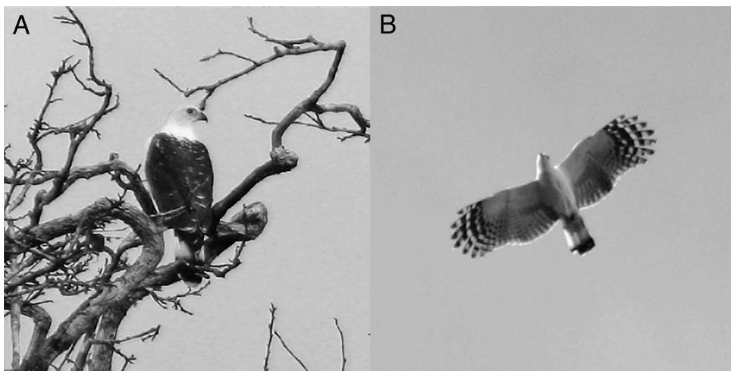
FIG. 2. Adult White-collared Kites recorded in Alagoas, Brazil in October 2007. (A). Perched exposed on tree after aerial display. Note white tips to feathers on mantle, back, secondaries, and primaries (Photograph by Sergio Seipke). (B). Soaring. Note white underwing coverts, boldly patterned primaries contrasting with rest of underwing and bulging secondaries on trailing edge of wings. This bird had a dark base of the tail and only one subterminal black tail band (Photograph by Sergio Seipke).

Ventral black tail bands were similar among all the putative subspecies ( F_{3,93} = 1.32 , P > 0.10 ) and the remaining tail bands varied somewhat between the subspecies. L. c. mexicanus has narrower ventral white tail bands (25.0 mm, 15.23–44.98 mm) than the other two subspecies ( L. c. monachus = 34.6 mm, 14.12–63.62 mm; L. c. cayanensis = 31.5 mm, 10.43–48.33 mm). This relationship explained little of the variance among subspecies ( r^2 = 0.14 , F_{3,85} = 5.83 , P < 0.05 ). The dorsal black band was greater for L. c. mexicanus (49.3 mm, 26.35–66.83 mm) than for L. c. cayanensis (38.6 mm, 13.37–56.3 mm, r^2 = 0.08 , F_{3,93} = 3.79 , P < 0.05 ). The dorsal white band was larger in L. c. monachus (24.2 mm, 12.4–63.6 mm) than L. c. mexicanus (15.4 mm, 6.82–39.18 mm, r^2 = 0.11 , F_{3,91} = 5.02 , P < 0.05 ). Thus, while the overlap in tail band width varied among subspecies and the difference in band width only explained between 8 and 14% of the variance in band width, we conclude that band width does not distinguish among subspecies.