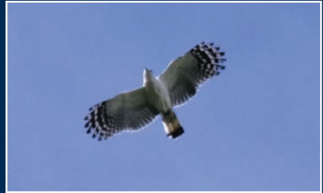
Figure 8. Adult White-collared Kite Leptodon forbesi gliding. Alagoas, Brazil, October 2007. Boldly patterned outer primaries contrast with lightly barred secondaries and white linings. Note white leading edge of the wings, and head. Many birds have two dark tail bands (Sergio H. Seipke)