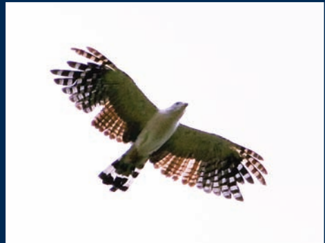
Figure 10. Juvenile White-collared Kite Leptodon forbesi moulting into adult. Alagoas, Brazil, September 2008. Inner secondaries and outer primaries retained from juvenile plumage browner. Note dark trailing edge of wings on juvenile secondaries. This bird was flying with adults (Christian Dietzen)