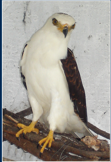
Figure 7. Juvenile White-collared Kite Leptodon forbesi held captive in Parque dos Falcoes, Itabaiana, Sergipe in 2007. Note the subtle black markings on the crown on an otherwise white head, and the extensive rufous tips to the upper-wing coverts