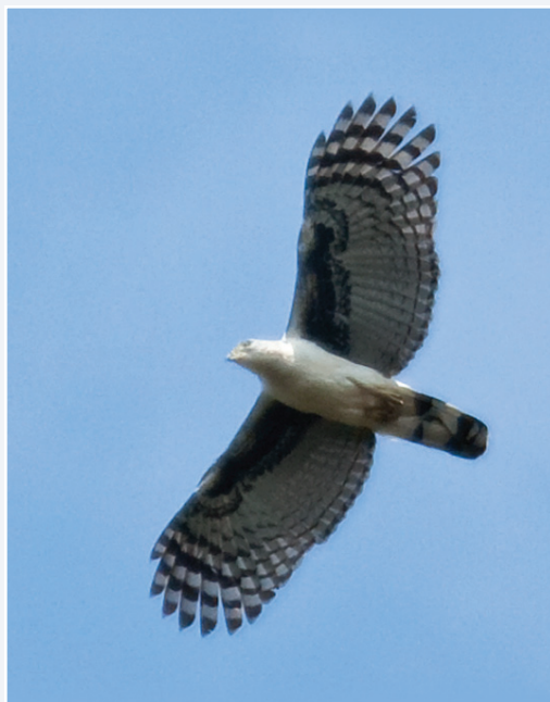
Figure 11. Grey-headed Kite Leptodon cayanensis subadult soaring. Misiones, Argentina, August 2008. Note a mix of black and white linings and yellow legs and facial skin. Although flight and tail feather look adult-like, coloration of bare parts and linings indicate this is not yet a full adult bird