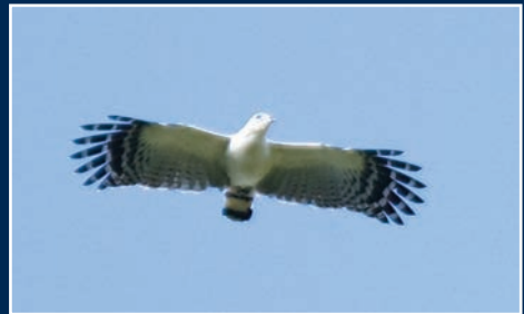
Figure 9. Adult White-collared Kite Leptodon forbesi soaring. Alagoas, Brazil, October 2007. Boldly patterned primaries contrast with rest of under-wing. Note bulging secondaries on trailing edge of wings. This bird had a dark base of the tail and only one subterminal black tail band (Sergio H. Seipke)