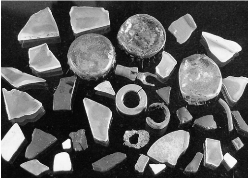
FIGURE 2. Gizzard content from condor 285. The presumed source of zinc toxicosis was the galvanized split-metal washer at center.

considered the primary factors. Four birds were killed by gunshot and another by arrow. One of the gunshot birds died of idiopathic interstitial pneumonia while being treated for a severe, open, comminuted fracture of the distal right tarsometatarsus caused by the gunshot. One additional bird had evidence of nonfatal gunshot, with shotgun pellets embedded in the body and one wing. The only confirmed infectious disease was a West Nile virus infection, complicated by secondary respiratory aspergillosis, that was the cause of death in one subadult (450) that had been vaccinated against West Nile virus (see Chang et al., 2007). Two females had ingested a variety of small trash items (see Table 2), including zinc-core pennies, which led to secondary zinc toxicosis as the immediate cause of death. Nine birds, three of them nestlings, had hepatic copper concentrations more than four standard deviations above the mean for the captive flock, but none had lesions suggestive of copper toxicosis (e.g., inanition and bile stasis in the liver). Two of them had ingested metallic trash. One bird (260) had evidence of zinc exposure but with no ingested foreign bodies present at necropsy.