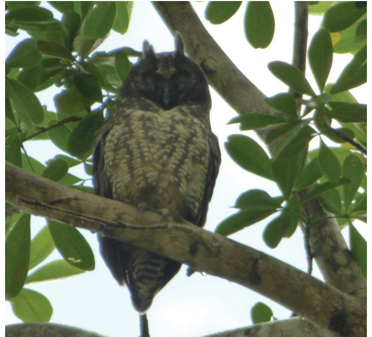
Figure 2 (Left). Individual observed in Apia-Risaralda, Western Range.; Figure 3 (Right). Individual observed in the Macarena-Meta, eastern Andes.

served two owls together. In the afternoons, they remained perched and at night we observed them entering the bell tower of the church, possibly to capture pigeons ( Columba livia ), however we never observed them with prey (Figure 3).