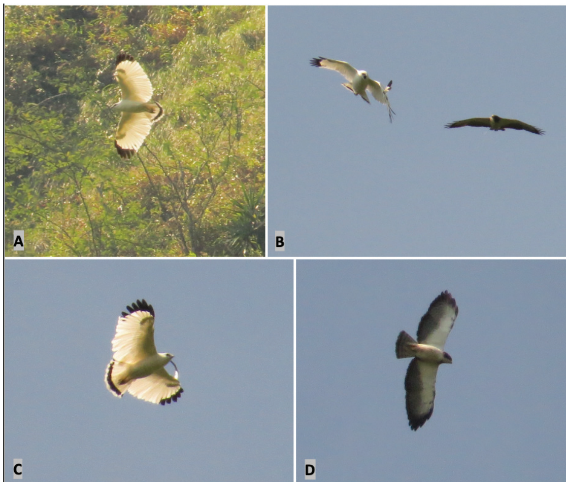
Figure 1. White Hawk ascending (A) and being attacked by Short-tailed Hawk (B). White Hawk (C) and Short-tailed Hawk (D) after the agonistic event.