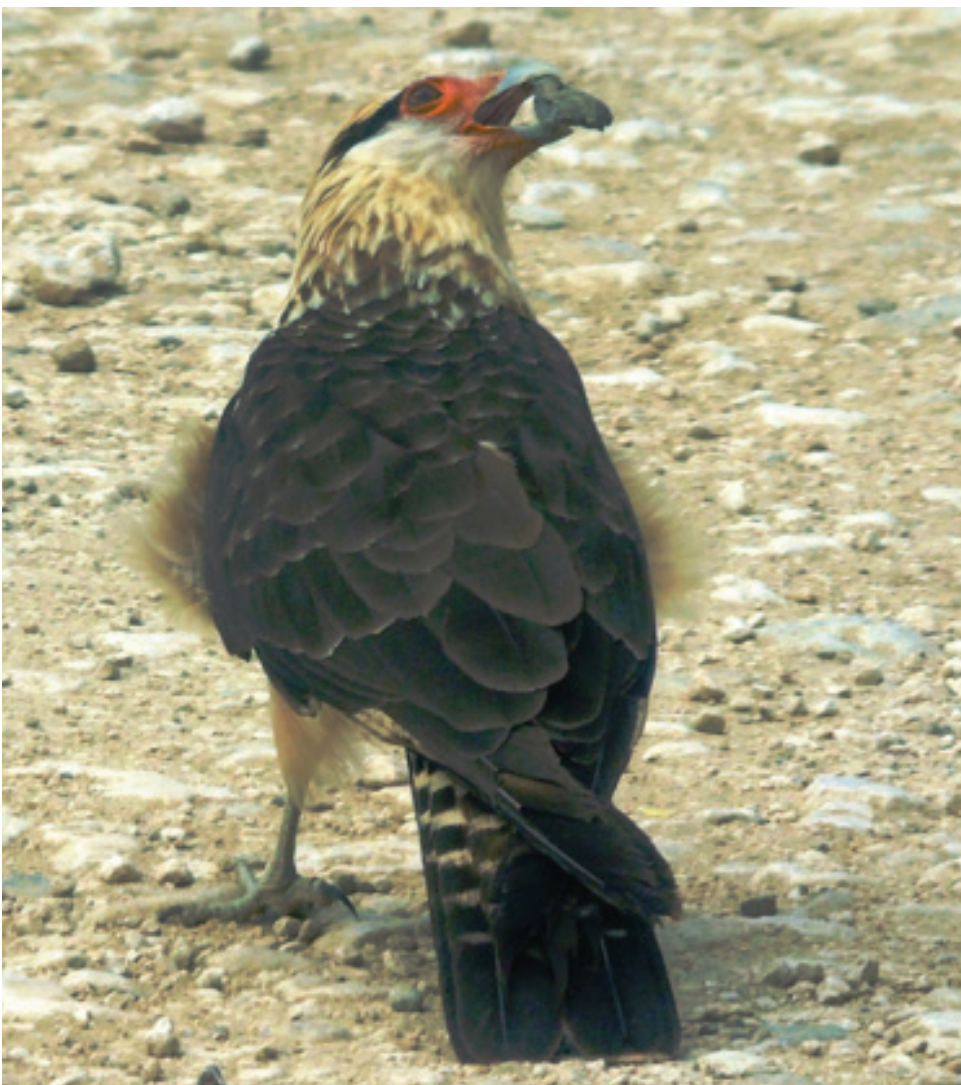
Figure 3. Yellow-headed Caracara with rock number 4, which it picked up and carried to a nearby tree on the way to La Casona, Indigenous Territory Ngöbe Bukle káite Jukribta, Coto Brus, Costa Rica.

The use of tools is a typical feature of the apes (Hominidae), but is uncommon in other vertebrates (Alock 1972). However, the use of tools has been documented in several bird species (Shumaker et al. 2011, Barcell et al. 2015). Parrots use tools to grab and open nuts (Emery 2006). Several crow species (Corvidae) use twigs, wood and sometimes metal wire to trap or impale lar-