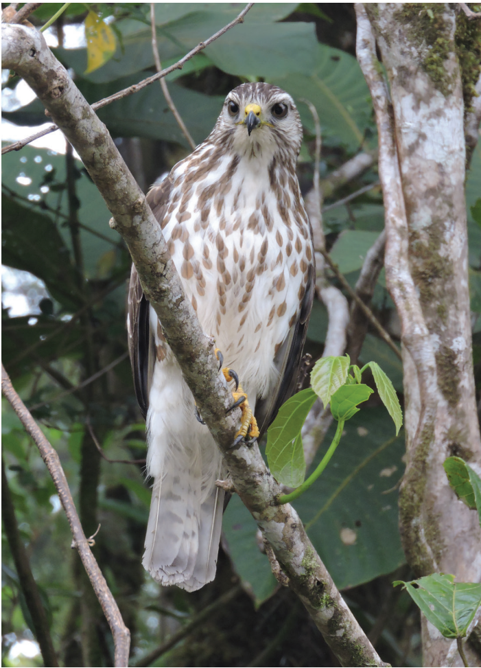
Figure 2. Despite having flown into a nearby tree because of our approach in a vehicle, the young hawk still showed interest in continuing to forage near the dung pile.

temperate countries (Nihei and Higuchi 2001). Additionally, foraging for beetles in dung is a common and important source of food for other diurnal raptors (Young 2015). Even the Burrowing Owl ( Athene cunicularia ) uses dung as bait to attract insects to its burrow (Levey et al., 2004).