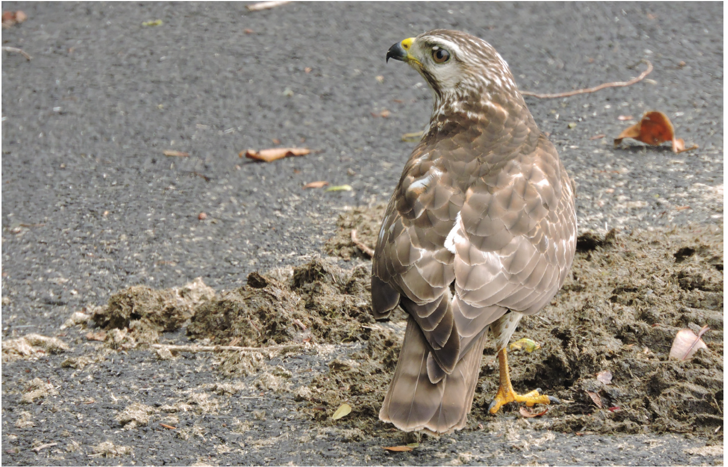
Figure 1. Juvenile Broad-winged Hawk foraging for arthropods in cow dung previously smashed by a vehicle in Vara Blanca, Costa Rica.

on the ground on recently crushed cow dung. We stopped the vehicle a few meters away. We were able to observe the hawk feeding on some type of arthropod (potentially dung beetles) that it removed from the dung with its beak. We hypothesized that the arthropods had also been crushed within the dung a few minutes earlier, and was seen as a feeding opportunity by the juvenile raptor (Figure 1).