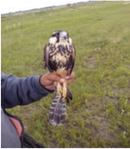
Figure 1. Freshly trapped Aplomado Falcon.

perched on a boundary post in the same location. No coordinates or photographs were taken. The falcon was observed during a period of approximately 30 minutes, while it was displaying hunting behavior. It was seen repeatedly chasing after meadowlarks ( Sturnella spp ), and returning to the same perch after every unsuccessful hunting attempt. Residents in the area also reported that this falcon species has been observed recently in the zone and, on occasion, in groups of up to three individuals (pers. comm.).