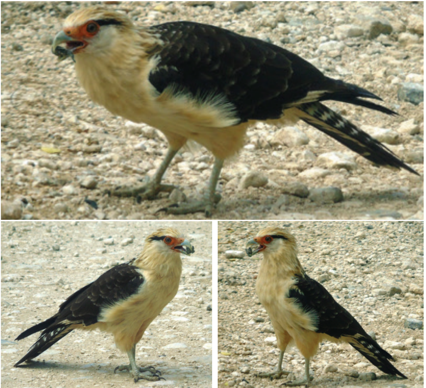
Figure 2. Yellow-headed Caracara with small rocks in its beak, which it later discarded (three events), on the road to La Casona, Indigenous Territory Ngöbe Bukle käite Jukribta, Coto Brus, Costa Rica.

have white and black spots at the base. The tail is cream with undulating bars and a dark, wide subterminal band. Juveniles are similar to adults, but are browner above; the parts that are cream-colored in adults, are dark brown dotted with blackish-brown in young birds.