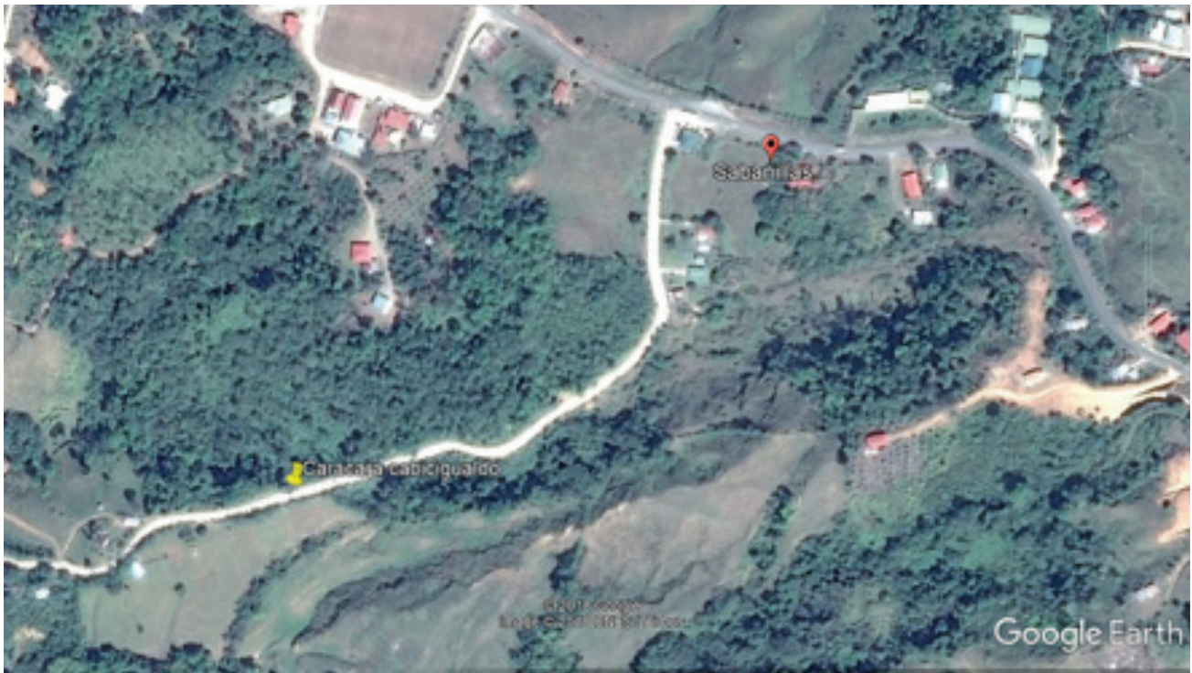
Figure 1. Observation point (yellow pin) of a Yellow-headed Caracara ( Milvago chimachima ) on the road to La Casona, Indigenous Territory Ngöbe Bukle käite Jukribta, Coto Brus, Costa Rica.