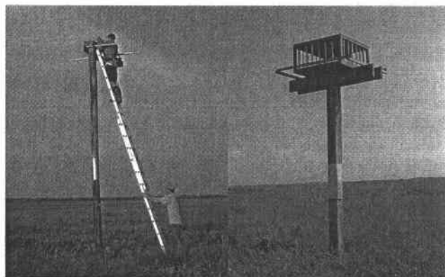
FIG. 1. Two designs of artificial nests provided for Aplomado Falcons in southern Texas. The "platform" design on the left is an open platform mounted on a 6-m pole; the "barred" design on the right is a solid-topped box with conduit sides spaced to allow birds access to the nest, mounted on a 3.5-m pole.

Nest-site measurements. —We measured nest-site characteristics either while banding nestlings or within two weeks following fledging or nest failure. Nest substrates were noted and tree–shrub species recorded if applicable. Potential nest substrates were either artificial or natural. Artificial nests could be "barred" nests, which are fully enclosed, with sides constructed of conduit spaced to permit passage of falcons, or "platform" nests, which are simple open platforms (Fig. 1). Natural nest substrates included Granjeno, grass, Huisache ( Acacia smallii ), Lime Pricklyash, McCartney Rose, mesquite, unidentified tree, Yaupon, and yucca. Because falcons do not construct their own nests, we determined