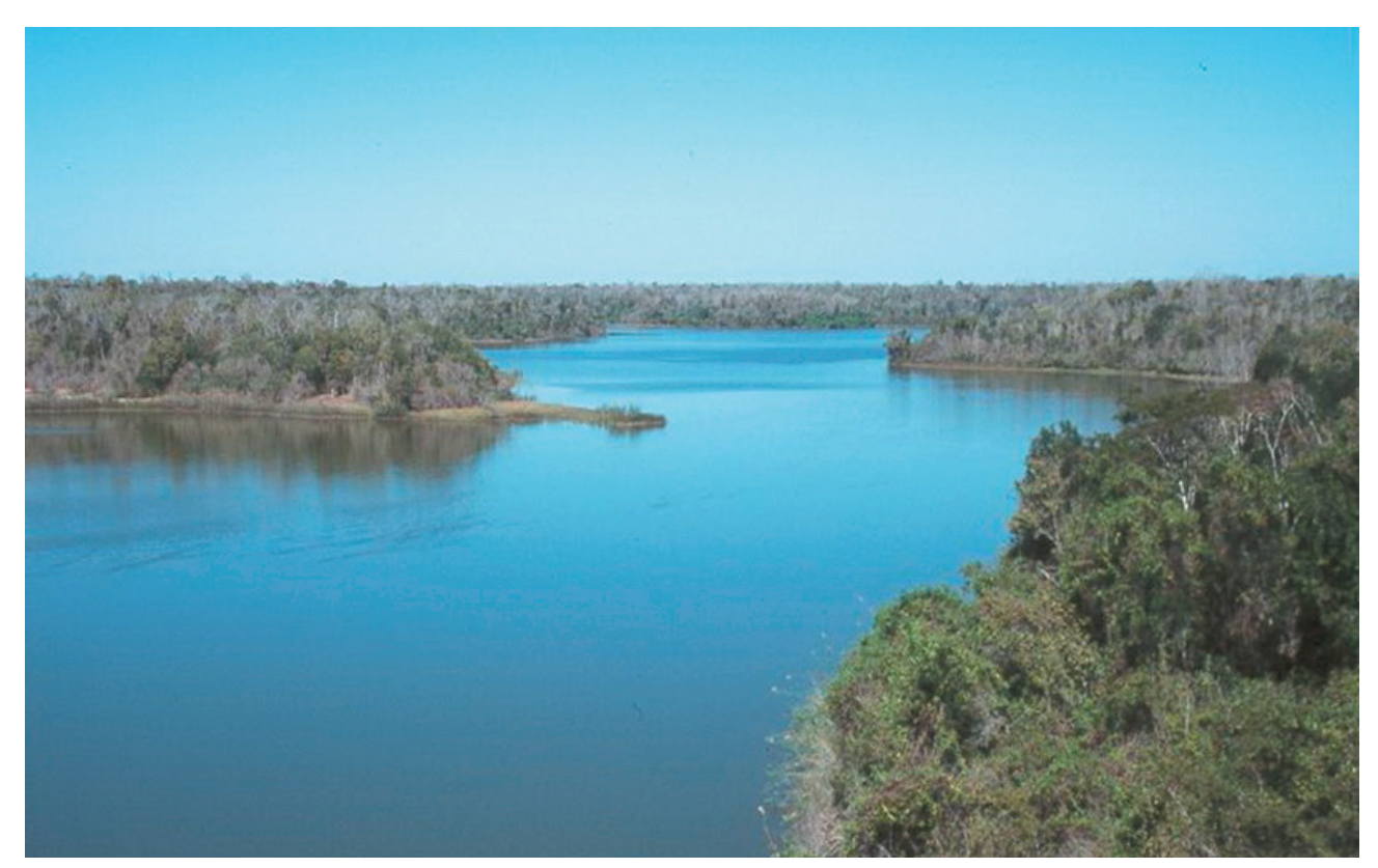
FIGURE 1. The Manambolomaty Lakes site is in the process of being added into the System of Protected Areas of Madagascar.