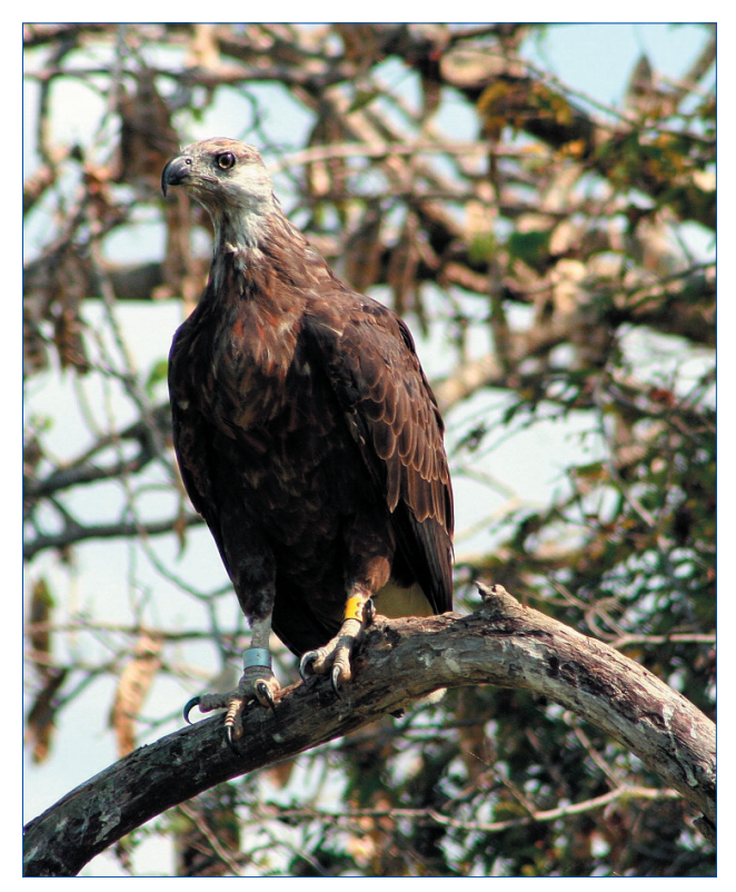
FIGURE 3. The endemic and critically endangered Madagascar fish eagle ( Haliaeetus vociferoides ). The Manambolomaty Lakes site has one of the highest concentrations of breeding fish eagles in Madagascar.

WETLAND INTEGRITY AND UNIQUENESS No traces of slash-and-burn agriculture have been documented within the main Tsimembo Forest managed by the FIZAMI and FIFAMA Associations. Such agricultural practice was devoted to Ziziphus mauritania (Rhamnaceae – introduced tree species) forest (TPF and DWCT 2003). Control of illegal camps was one of the tasks of the Associations and forestry representatives from Antsalova, the nearest district town. An illegal camp in Bekofoky (Ankerika), for instance, was removed in August 2005. The 8<sup>th</sup> legal camp at Akoririky was also removed in 2004 because fishermen were deforesting a 65 m x 20 m area for extending the camp without the Association's permission. This deforestation altered wetland