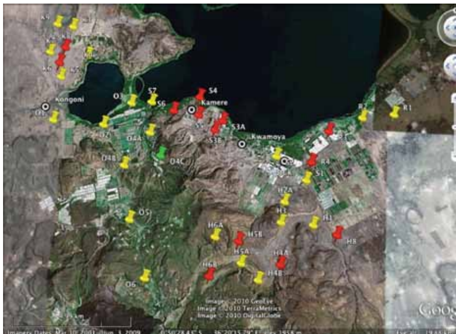
Map of Augur Buzzard territories in the south Lake Naivasha area. Yellow tacks indicate active territories, red tacks indicate abandoned territories, and the green tack indicates a newly documented territory. Note the concentrated clump of abandoned territories around the town of Kamere.

reasoning, over a three-month period in mid-2010 I set out to assess the current status of the Augur Buzzard population -- over a decade after Virani's initial study. My goal in this research, which was overseen by Virani, was to revisit and closely monitor all of the documented breeding territories in the region and to determine whether they are still active. The pressing question is whether the Augur Buzzard -- a species that is regarded as highly adaptable to human alteration of habitats -- has been able to withstand the drastic land-use changes that have taken place around Lake Naivasha.