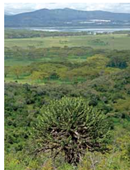
The Lake Naivasha region seen from Mundui Ranch.

With increasing demand in major markets in Europe and North America for goods produced with more sustainable environmental and social practices, there is a growing economic incentive for companies to improve their image. Oserian is a Fairtrade and LEAF- (Linking Environment and Farming) certified company, leading the way among the Naivasha horticultural community in this regard. The company has taken positive steps, including: setting aside an 18,000-acre wildlife reserve and an additional 3,000-acre wildlife corridor in 1996 that allow for passage of animals from Mount Longonot and Hell's Gate National Parks to Lake Naivasha's shore; producing their own geothermal energy and using steam to control humidity and temperature in