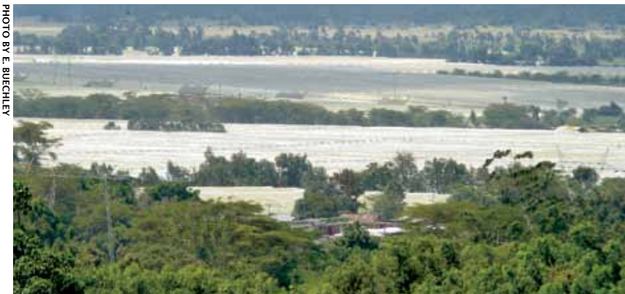
Horticultural farms in the Lake Naivasha area.