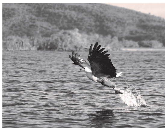
Fish Eagle: one of the species affected by pesticide use in the region.

To achieve these aims and to ensure that they are sustainable, FASTA is working to create a critical mass of local scientists with expertise in advanced analytical technology. This base of knowledgeable people can then respond rapidly to emerging environmental issues worldwide, with emphasis on Africa, while offering high quality analysis.