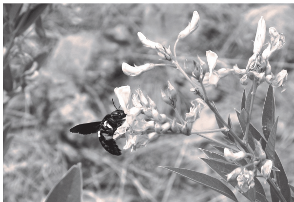
Pesticide exposure is monitored by studying bees and their habitat.

lakes, where they are found in high densities. The African population appears to have decreased over the last two decades at both lakes. Increased agriculture in and around the lakes and subsequent chemical runoff into the lake waters could be contributing to this decline. The objective of the study is to screen water, sediment, fish and fish eagle blood sampled for pesticides and compare chemical residues with areas in close proximity to flower farms. This study is