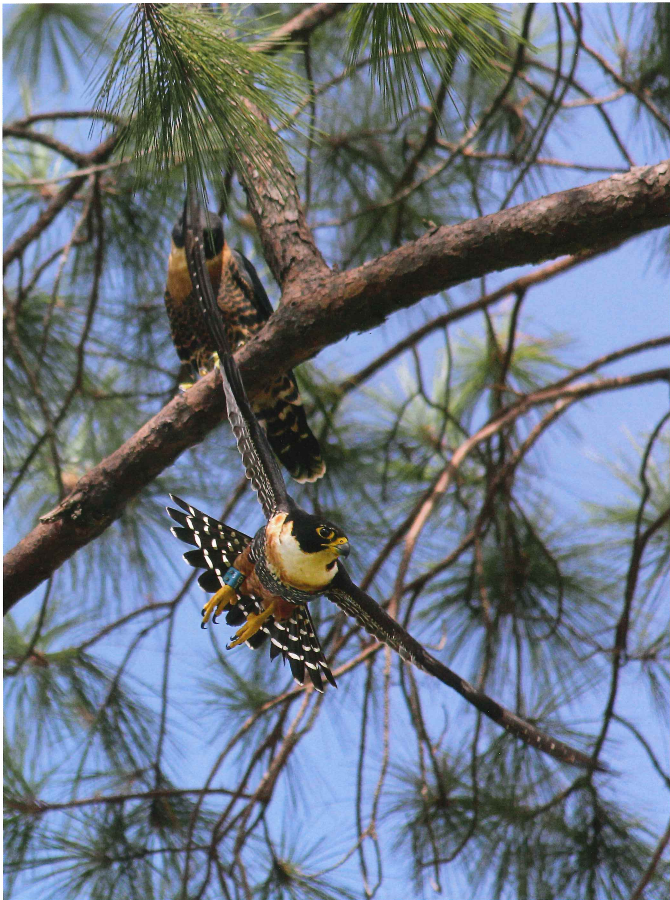
Captive-bred male B1 takes flight near the back site, watched by his wild mate, Caya. The pair made history in 2013, fledging three beautiful youngsters and proving that captive-bred Orange-breasted Falcons can survive and breed successfully in the wild.